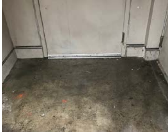
600 Block of Mission St