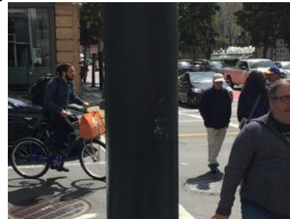
600 block of Mission St.