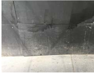
700 block of Mission St