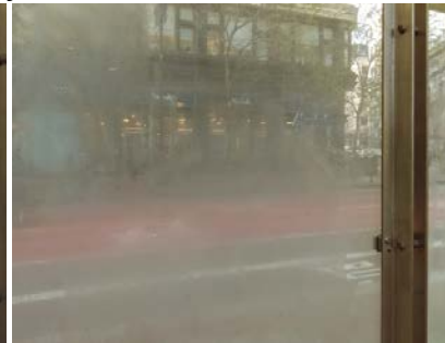
700 block of Market Street