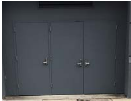
300 block of Tehama St