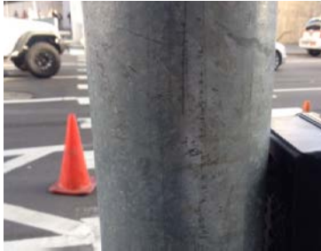
4 th and Mission