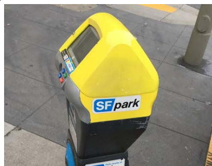
800 block of Mission St