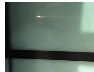
800 block of Mission St