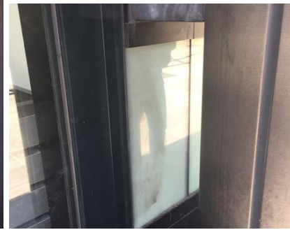
800 block of Mission St