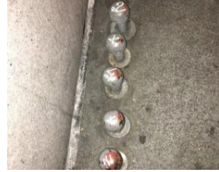
0-100 Block of 3rd St