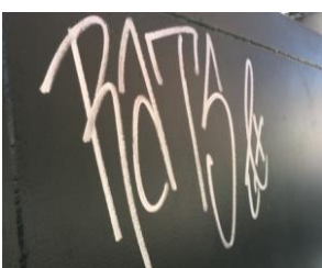
600 Block of Howard St