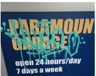
0-100 Block of 3rd St