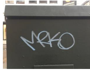
0-100 New Montgomery St