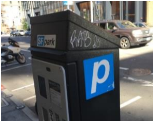
600 Block of Howard St