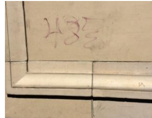
New Montgomery St