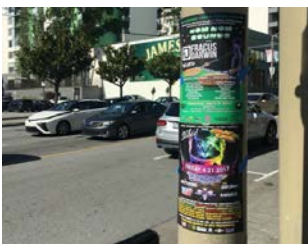
600 Block of Harrison St