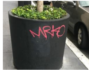
0-100 New Montgomery St