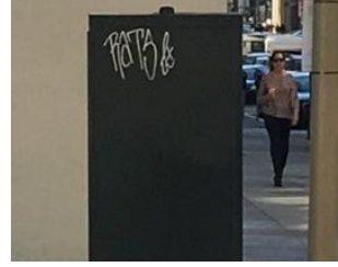
600 Block of Howard St