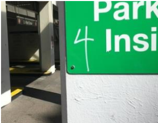
200 Block of 3rd St