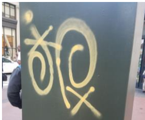
New Montgomery Street