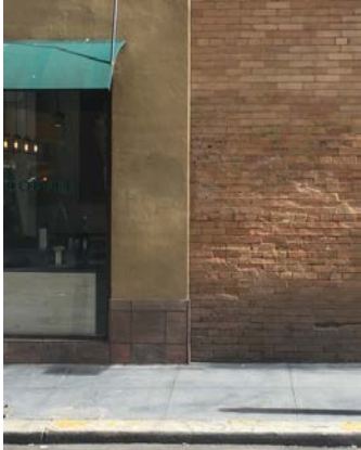
New Montgomery Street